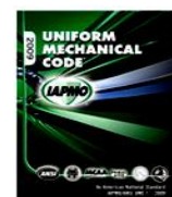
2009 Uniform Mechanical Code (Soft Cover) $103.00

Non-Members, Guests Invited Meeting Thursday April 22, 2010