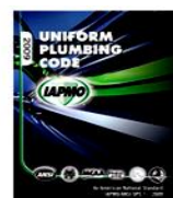
2009 Uniform Plumbing Code (Loose Leaf) $126.00

Code books are available at the IAPMO online book store at http://www.iapmostore.org