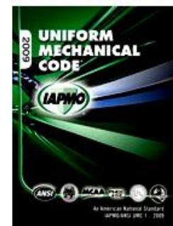
2009 Uniform Mechanical Code (Soft Cover) $103.00

Code books are available at the IAPMO online book store at http://www.iapmostore.org